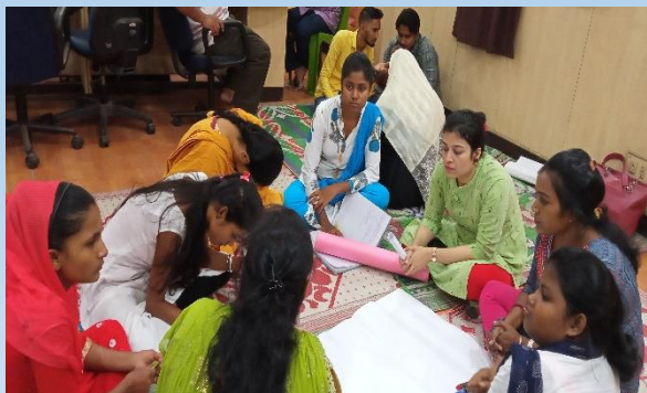
Bridge Course Training in progress

A two-day bridge course training was conducted on 26 th and 27 th September, 2022 for 15 teachers of Special Training Centres (STCs) and Child Assistance Centres (CACs) of Indradhanush Project. The focus area of this training was to develop concepts on designing primary level impact-based activities in English, Bengali, Urdu and Mathematics; introducing the concept of TLM development and how to use it along with lesson planning; and to introduce methodology of level assessment of basic language and mathematical skills.