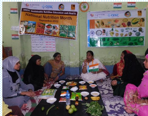
The training session underway

Nutrition month was observed under SNEH Project in September, 2022. 161 community women comprising of 43 pregnant women, 23 lactating mothers and 95 mothers of the children between 7 months to 2 years age group participated in the programme. The beneficiaries were sensitised regarding importance of having nutritious food especially during pregnancy. Causes and effect of malnutrition and over nutrition, various types of nutritional food available at affordable prices, types of essential vitamins and minerals, and correct ways of cooking food and cutting vegetables and fruits was shared with them. Through cooking demonstration, participants were explained about proper process of cooking, which will help in retaining maximum nutrition in food.