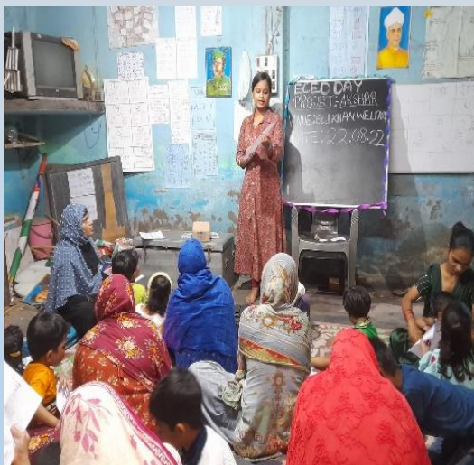
ECED Day Celebration

Early Child Education and Development (ECED) Day is organised once every quarter at the ECED centres of Akshar Project. The primary goal of this event is to generate awareness about appropriate early childhood education and mobilise parents to increase their involvement in early childhood care and school readiness of children. In August 2022, ECED days were organised in the different centres to establish the partnerships through community level advocacy, awareness generation and participation of the parents in learning process. Parents were oriented on how they can help a child to attain educational, physical, mental and emotional development at home. Also, mothers of the children of 6 years of age (who will be admitted in formal schools) were guided on the process and required documentation for admission into formal schools. Total 101 children and their parents participated in the events. The programme was made colourful with rhymes, songs performed by the children.