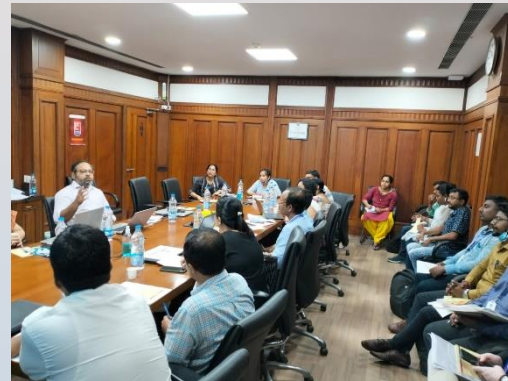
The training programme on SROI in progress