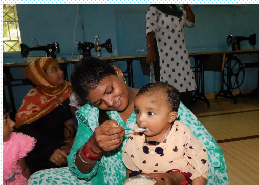
A child being fed semi-solid food as part of the Annaprasan Ceremony

For introducing complementary food in an infant's feeding schedule, weaning ceremonies (Annaprasan) were conducted under SNEH project for 40 children who completed 6 months. The event was conducted in collaboration with the Anganwadis. 40 mothers and 9 maternal uncles along with their children participated in the ceremony. They were sensitized about the necessity of semi-solid food, importance of feeding nutritious food items in sufficient quantities frequently along with the right proportion of nutrients to ensure proper development of the child.