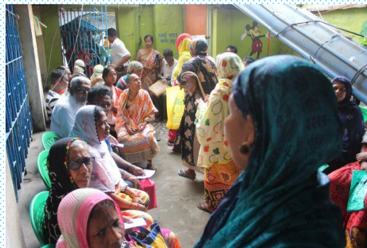
An Eye Camp at Pujali, Budge Budge underway